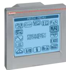
Interfaces and expansion modules