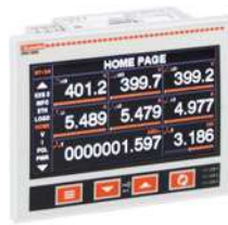
DMG power analysers