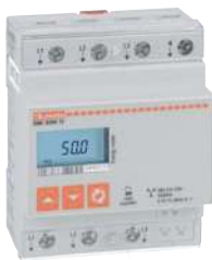
DME energy meters

Cutting-edge products seamlessly integrated to provide real-time monitoring and analysis