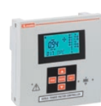
Power factor controllers and thyristor modules