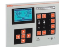
Automatic transfer switch controllers