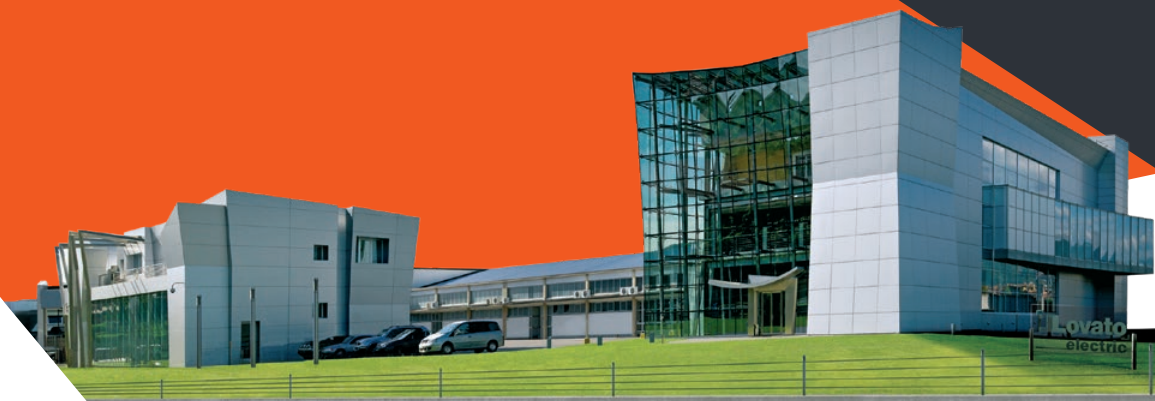
LOVATO Electric headquarter - Bergamo (ITALY)