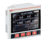
Energy meters and power analyzers