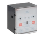
Earth leakage relays