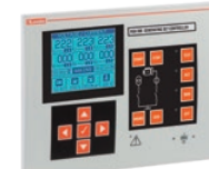
Engine and generator controllers