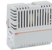
Automatic battery chargers