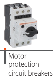
Motor protection circuit breakers