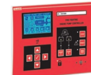
Fire pump controllers