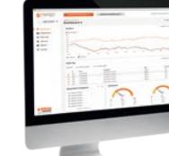
Software and Apps

5 GROUPS 36 PRODUCT FAMILIES 21,000 CODES