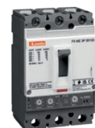
Moulded case circuit breakers